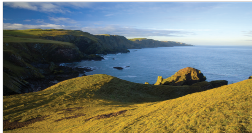
Undulating hills and cliffs along the east coast, looking north from the St Abbs National Nature Reserve.