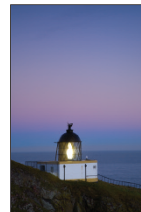
The St Abbs lighthouse