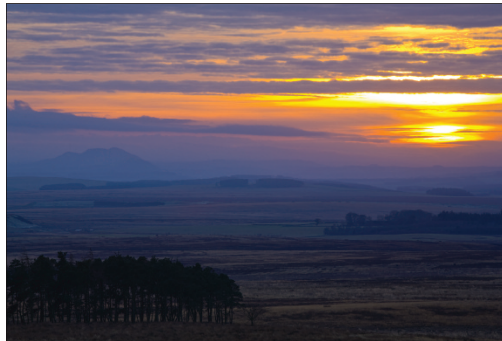
Hazy sunset looking towards the Eildon Hills from near the town of Duns.