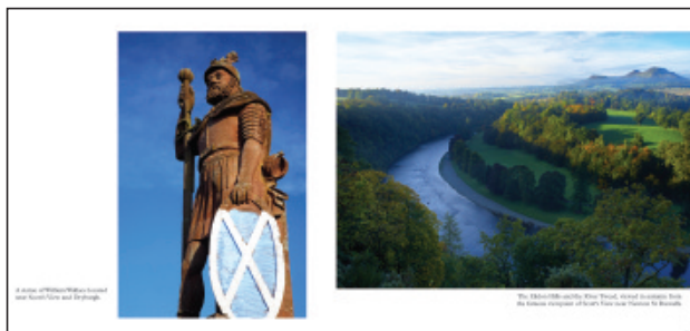
Example of a double page spread.