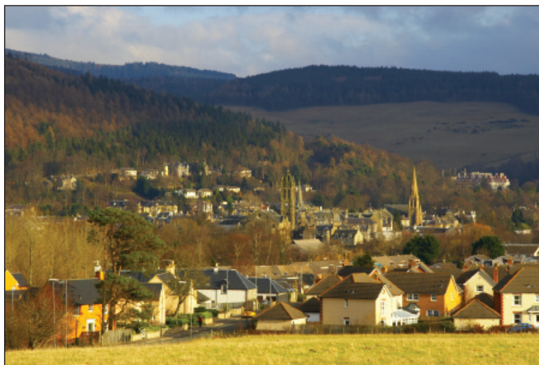
The town of Peebles, with the Glentress Forest in the distance.